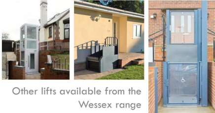
Other lifts available from the Wessex range

Our team can offer advice on everything from feasibility to installation and after care, together with an unparalleled level of technical support.