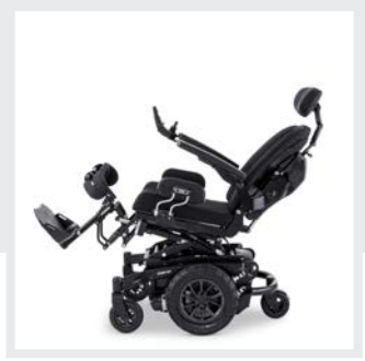
Memory function records movement patterns and preferred positions