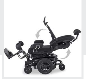
Advanced lie-down function with biomechanics for armrests and headrest