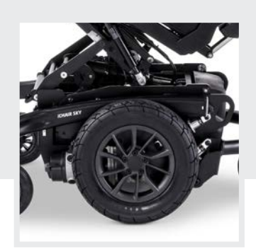
Mid-wheel drive for utmost agility and precise manoeuvring