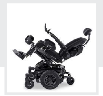
40° tilt for effective pressure relief